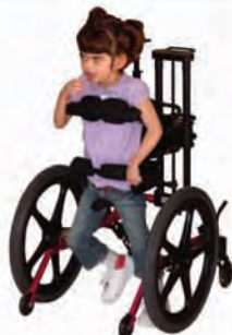
Encourages Natural Gait